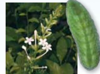
Cassius Blue Leptotes cassius Doctorbush Plumbago zeylanica