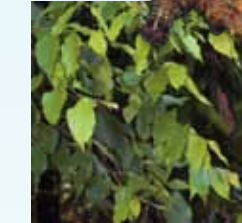
Question Mark Polygonia interrogationis Sugarberry Celtis laevigata