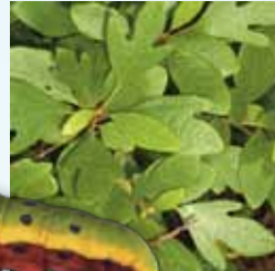
Eastern Tiger Swallowtail Papilio glaucus