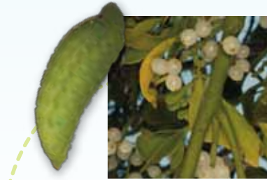
Great Purple Hairstreak Atlides halesus Oak Mistletoe Phoradendron leucarpum