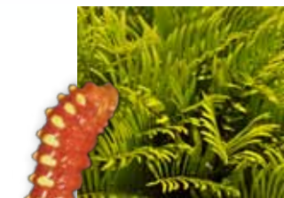
Atala Eumaeus atala Coontie Zamia pumila