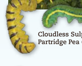
Cloudless Sulphur Phoebis sennae Partridge Pea Chamaecrista fasciculata