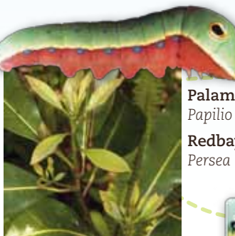
Redbay Persea borbonia

Florida Museum of Natural History UF Cultural Plaza 3215 Hull Road Gainesville, FL 32611-2710 352-846-2000 www.flmnh.ufl.edu