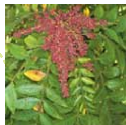
Red-banded Hairstreak Calycopis cecrops Winged Sumac Rhus copallinum