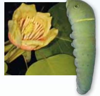
Tuliptree Liriodendron tulipifera