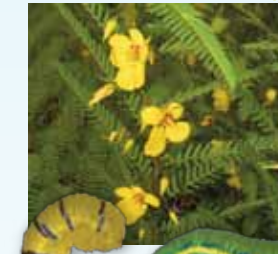
Cloudless Sulphur Phoebis sennae Partridge Pea Chamaecrista fasciculata