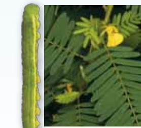
Little Yellow Eurema lisa Sensitive Pea Chamaecrista nictitans