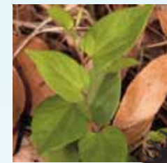
Pipeline Swallowtail Battus philenor Virginia Snakeroot Aristolochia serpentaria