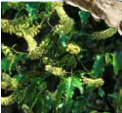
Red-spotted Purple Limenitis arthemis astyanax Black Cherry Prunus serotina