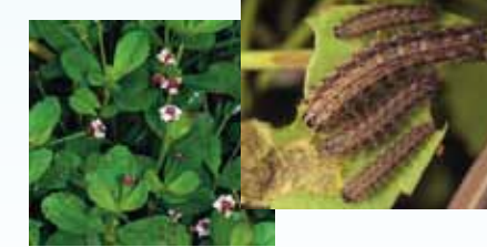
Phaon Crescent Phyciodes phaon Turkey Tangle Fogfruit Phyla nodiflora