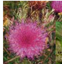
Little Metalmark Calephelis virginiensis Purple Thistle Cirsium horridulum