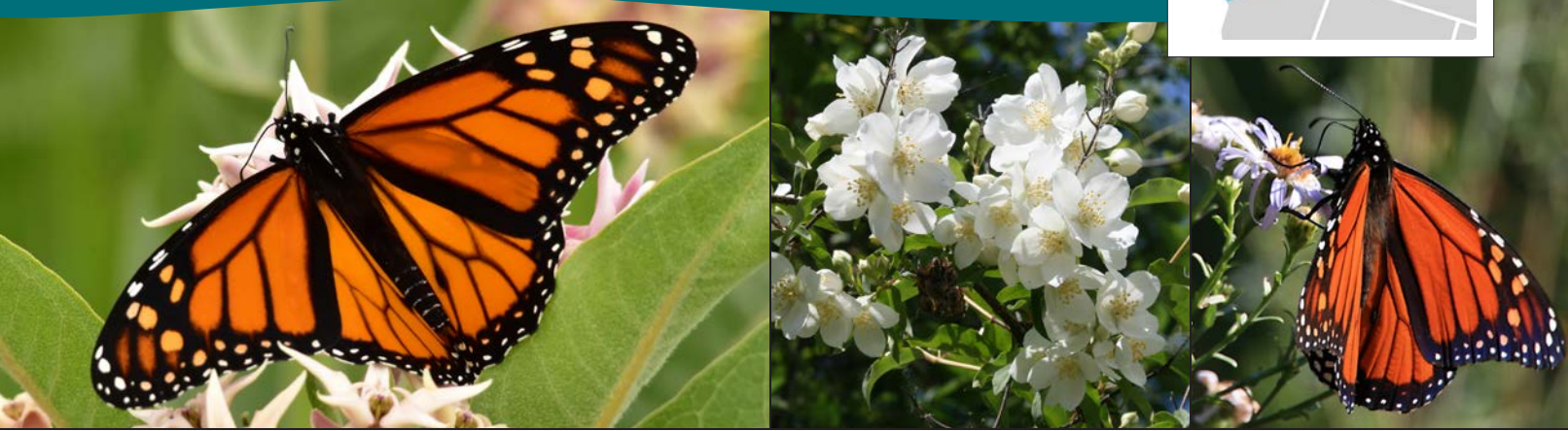
Left to right: Monarch on showy milkweed, Lewis' mock orange, and monarch on Pacific aster.

The Maritime Northwest is a region of windswept coastlines, temperate rainforests, sprawling grasslands, and subalpine meadows. It encompasses the coastline and coastal ranges of Washington, Oregon, and northern California; the western slopes and crest of the Cascade mountains to the east; and the open prairies and agricultural lands of the Puget Trough and Willamette Valley in between. The variety of elevations and rainfall patterns found in this area has created diverse plant communities that support a number of native pollinators and other wildlife. Monarch butterflies, while scarce from the Willamette Valley north due to natural limits on milkweed distribution, can still be found in this region during the summer months.