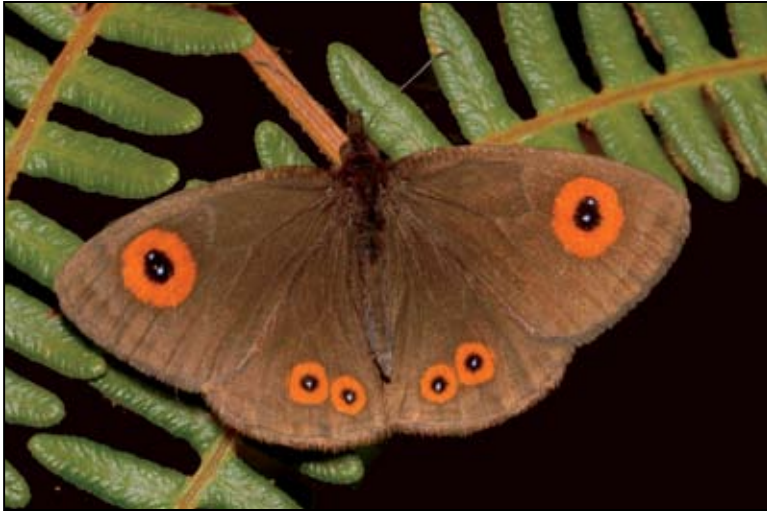
Satyrine butterflies have been important in planning new parks on Madagascar. Unlike many species on that island, satyrines may appear drab at first glance; looked at more closely they are really quite beautiful. Strabena argyrina