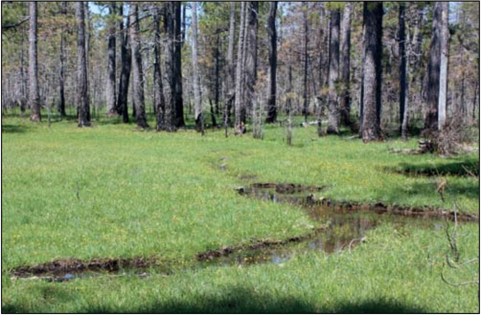
The charred trunks are now the only clue that this area of Coon Mountain has been burned.

Without management this meadow would become a tinderbox.