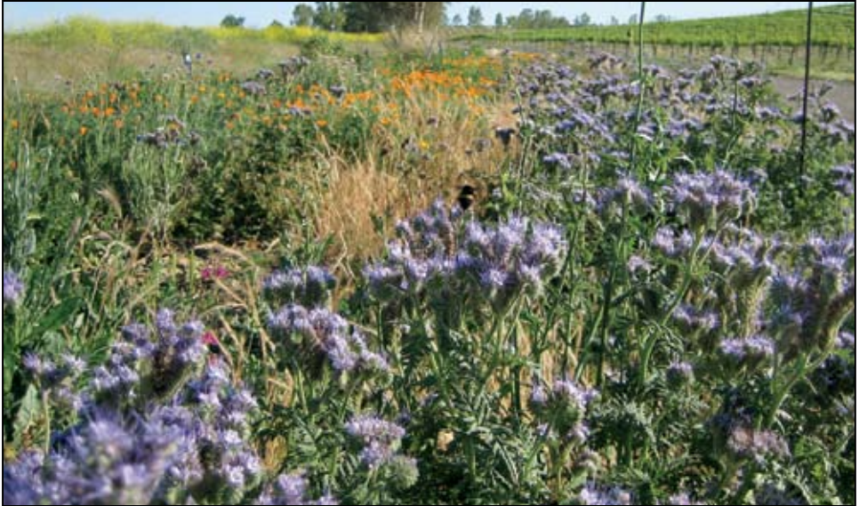
Three recently awarded grants allow Xerces to expand our pollinator conservation work, including creating habitat guidelines for six different regions in North America, in concert with a variety of private and public partners.

Our third successful grant proposal will see our agricultural pollinator program working nationwide. To implement “Native Pollinator Habitat in Diverse Agricultural Landscapes” we will work in California, Oregon, the Upper Midwest, New England, Pennsylvania, and Florida. For this project we will develop pollinator conservation project plans specifically designed for these six different areas. We will work with regional partners to conduct trials of native and pollinator-friendly plant mixes in each area, document the re-