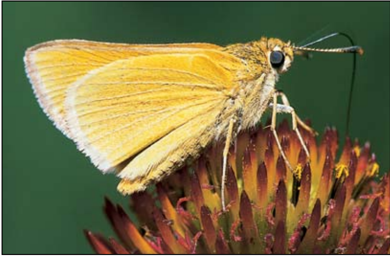
An awareness of the rich diversity of insects that live in grasslands is the first step toward improved management of these important habitats, and a greater return on the money invested in their restoration. Arogo skipper ( Atrytone arogos)

Rigorous research on grassland invertebrate conservation in the United States and Europe has repeatedly shown that managed disturbance can be optimized to conserve multiple sensitive species. Careful rotation of burning, grazing, or mowing on fractions of sites can be coordinated to benefit a variety of life histories and host-plant associations. But designing such management requires an equally careful inventory of the invertebrate habitat at a site—a seemingly obvious step that gets left out of most of the “best practices” documents for bird conservation.