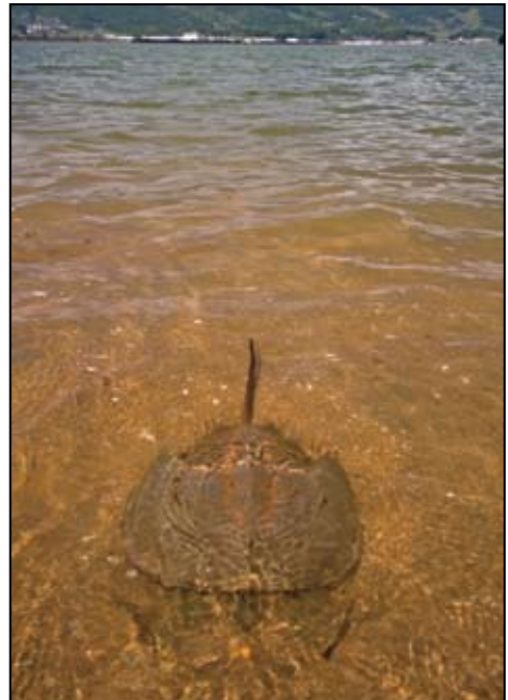
The sighting of just four pairs of horseshoe crabs generated excitement at the annual festival in Kyushu, Japan. Tachypleus tridentatus