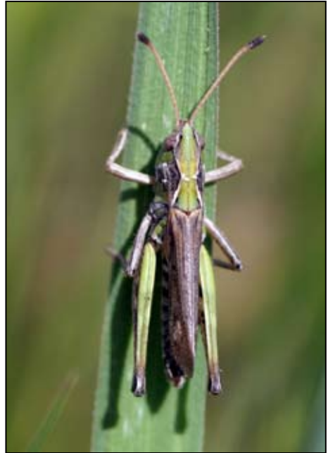
Grasshoppers are a key component of the diet of game birds such as prairie chicken and grouse. Club-horned grasshopper ( Aeropedellus clavatus ), photographed by Dan Johnson.

In 1985, recognizing the importance of game birds and their shrinking populations, federally funded conserva-