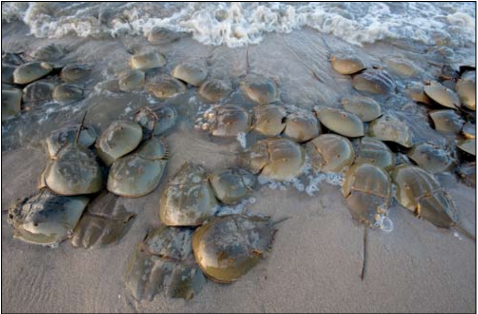
Mobs of mating horseshoe crabs ( Limulus polyphemus ) throng Delaware Bay at the tide's edge. But these numbers are tiny compared to the hordes that are known to have covered the beach a century ago.

In response to these declines, the ornithological community in the United States sprang into action. Petitions were signed, studies were conducted, and eventually laws protecting the birds were enacted. People had finally made the connection that, if the crabs disappear, so would the birds, and thus we probably should try to save these seemingly lowly invertebrates. In New Jersey, where just a couple of years ago it was acceptable to drive a pickup truck