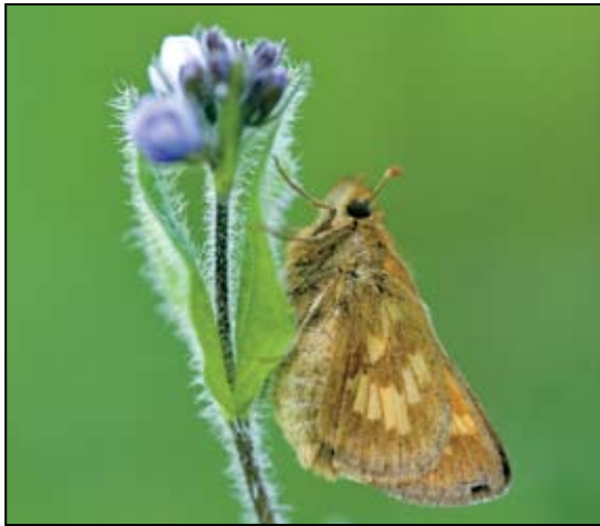
Protecting the mardon skipper ( Polites mardon ) during grassland burning has been a focus of Xerces Society research in recent years.

Service lands in northern California. The state was known to be home to only a few very small populations and these agencies wanted to see if surveys would find more sites. The mardon skipper has a short flight season, so all surveys were squeezed into a brief two-to-three-week period when the adults were expected to be on the wing. In 2007 we surveyed dozens of areas, but found no new populations of skippers. Surveys in the second year seemed to be heading in the same direction until the last day of field work.