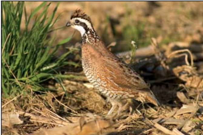
Conservation programs for animals such as the bobwhite quail can benefit invertebrates—and may in fact rely on them for success—but often overlook them during planning.

In this issue of Wings , we explore the idea of “piggyback” conservation—how the conservation of one species can lead to the protection of others. The first essay lays the groundwork by discussing what this concept means and brings us full circle to an instance of vertebrate conservation piggybacked onto pollinators. We look at the situation of a rare butterfly that literally cannot escape the heat during controlled fire to improve habitat. Two articles explore the ways that the Farm Bill’s provisions for providing bird habitat may help or harm insects depending on the circumstances. Last, we delve into the case of horseshoe crabs, for which survival may depend on efforts to protect the red knot, a migratory shorebird.