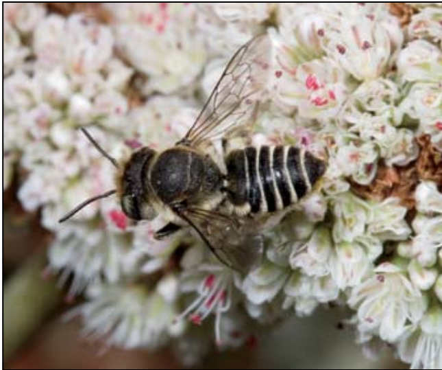
Recent declines in honey bees have underscored the importance of native bees for crop pollination. Leafcutter bee (genus Megachile)

By partnering our research with a pollinator outreach program run by the Xerces Society, our pollinator project in Yolo County has had far greater impact than I ever imagined. For example, after hundreds of pollinator workshops and meetings, the Xerces Society has convinced California’s Natural Resource Conservation Service (part of the U.S.