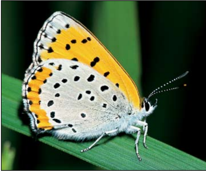
The story of the disappearance and rediscovery of the bronze copper ( Lycaena hyllus ) underscores the fact that the needs of the smallest animals often go unnoticed by many farmland conservation programs.

more than 80 percent of the forests had been cleared. The modest natural grasslands owing to beaver-created bottomland meadows, hillside fens, or hilltop and sandplain wildfires were now augmented by extensive if anthropogenic clearings. Grasslands, formerly quite limited, became the dominant element of the landscape. From one horizon to the other, a patchwork of pastures and hayfields, punctuated here and there by woodlots and wetlands, provided exponentially more grassland habitat than had existed before. A veritable all-you-can eat buffet for the species whose preferences ran more to grass blades than tree leaves had turned on its “welcome” sign.