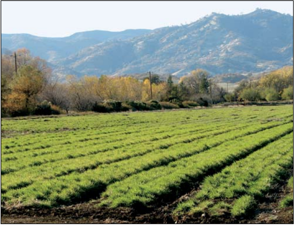
California's Central Valley is dominated by agriculture, with habitat restricted to the surrounding hills and riparian areas. As part of the effort to re-wild parts of the landscape in the agricultural areas, hedgerows have been planted for wildlife.

Taking another tack in California's Central Valley, an agricultural region that produces a quarter of the United States' fruits and vegetables, I am on a campaign to re-wild the monocultures that now blanket this huge expanse. Through restoration of native plant hedgerows, the goal is to bring back some of the ecological services, such as pollination and pest control, that natural habitat used to provide within agro-ecosystems. Many growers are receptive to the hedgerow concept, but for varying reasons. For some, it's because they like to hunt, and they need to restore some habitat on their fence-