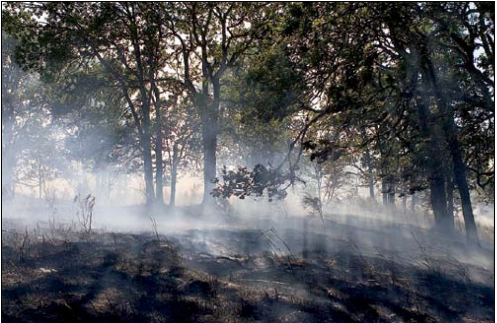
Controlled fire is an important and widely used tool for managing grasslands and forests.

No matter how you feel about it, controlled burning is an increasingly common management tool, and those on all sides can agree that fire has long played an important role in native ecosystems. Prehistorically, most fires were probably caused by lightning, but once humans obtained the necessary skills to start fires they began using them to shape landscapes. Some Native Americans burned grasslands year after year to keep the forests from encroaching and to maintain favorable habitat for the game and plants they traditionally hunted and harvested.