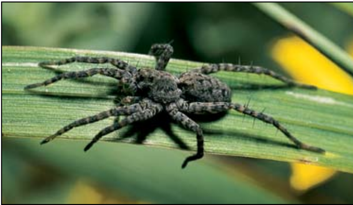
The open, sunny habitats that are created through projects supported by the Farm Bill suit a wide range of invertebrates. Predators like this wolf spider (family Lycosidae) in turn help to control pests in adjacent crop areas.

Of course, the farmer’s work doesn’t stop there. Because early successional habitat is, by definition, in the process of change, once it has been established the farmer must employ continuous management in order to maintain its status. And because the duration of a Farm Bill program contract is two to ten years (essentially the time it takes to create the habitat), the ongoing cost of maintaining the habitat becomes the