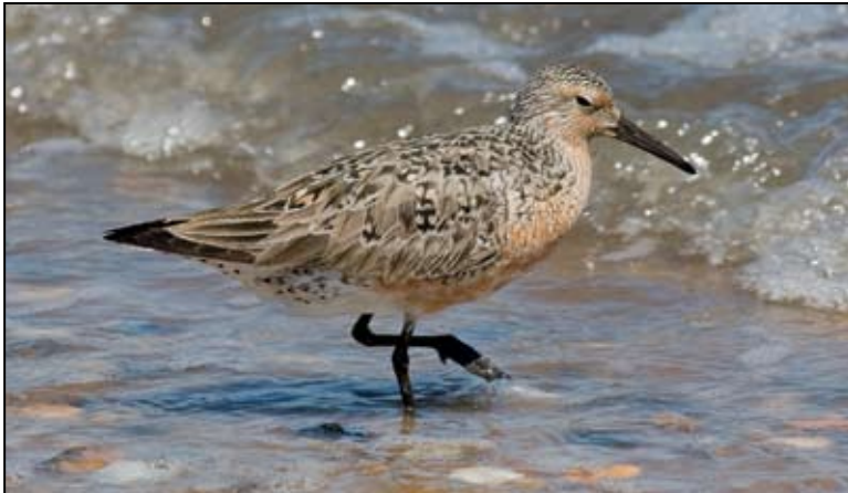
Red knots migrate from the southern tip of South America to their breeding grounds in the Arctic. Success in this journey relies on the presence of horseshoe crabs during their stopover at Delaware Bay.

But there were other species affected by the waning numbers of horseshoe crabs. Chock-full of fat and protein, the eggs of the Atlantic horseshoe crab are an ideal fuel for scores of shorebirds. As reliable as a Swiss clock, horseshoe crabs could be counted on to spread a delicious smorgasbord of fresh eggs on the shores of Delaware Bay, always there on the morning following the new and full moon of the late spring months. One bird in particular, the red knot ( Calidris canutus rufa ), owes its very survival to horseshoe crabs. Mixed in with flocks of other shorebirds, the red knot may not