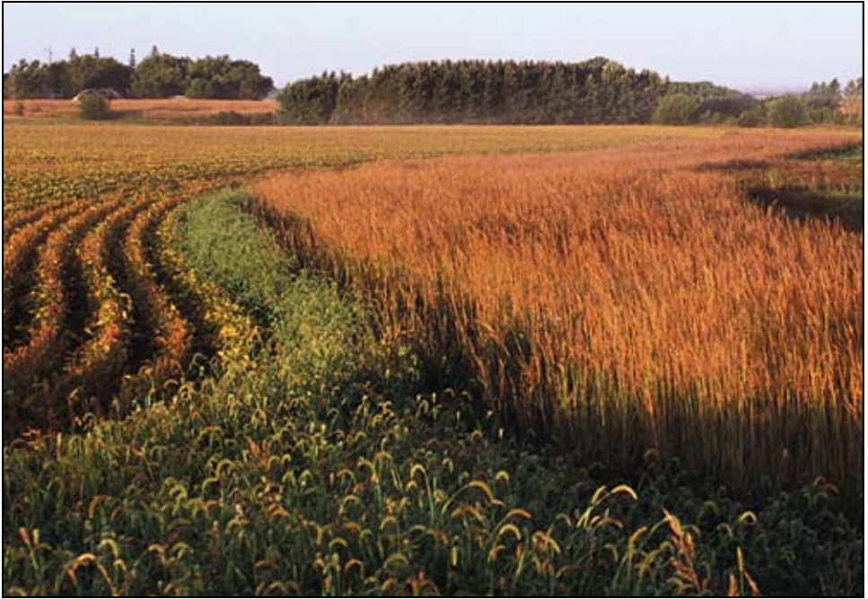
The U.S. Farm Bill provides funding to support environmental improvements and habitat creation. Photograph of a buffer strip in Iowa by Lynn Betts, courtesy of the Natural Resources Conservation Service.

much wider range of agriculture-related issues, from school meal nutrition and farmers' markets to crop insurance and biofuels. The bill also provides funding for a slew of wildlife and conservation programs that support the creation of habitat on farms and ranches. Some initiatives supported by the Farm Bill—such as the Conservation Reserve Program, the Environmental Quality Incentive Program, and the Wildlife Habitat Incentive Program—specifically identify fish and wildlife species of conservation concern as a priority. Others target particular habitats: the Wetland Reserve, Grasslands Reserve, and Healthy Forest Reserve programs facilitate the purchase of easements and promote native habitat restoration