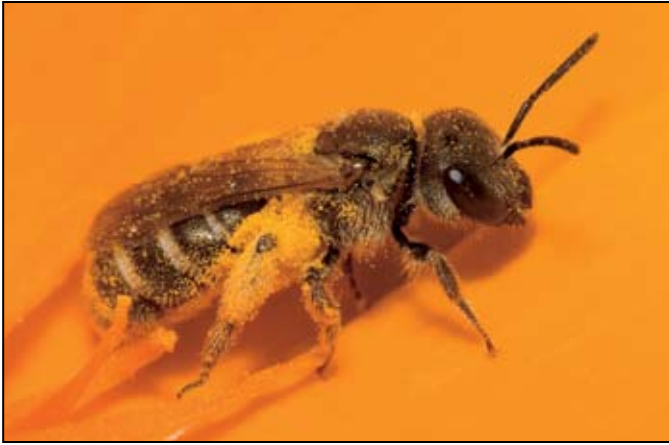
Small insects such as this sweat bee (genus Halictus) may now be carrying the burden of conserving rare plants and animals.

Department of Agriculture) to provide 90 percent of the costs of habitat restoration to farmers willing to implement a “pollinator conservation hedgerow”—a strip of pollinator-attractive flowering forbs on both sides of a hedgerow of flowering shrubs—thereby providing a diverse community of pollinators with floral resources throughout their long flight season. This year, twenty-two growers are receiving funds to plant such hedgerows, restoring in a small way some of the functions of the fabulous “bee meadows” that John Muir chronicled in his nineteenth-century writings about the Central Valley.