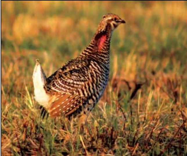
Habitats provided for sharp-tailed grouse and other game birds could offer even greater benefit for invertebrates with some minor changes in design or management.