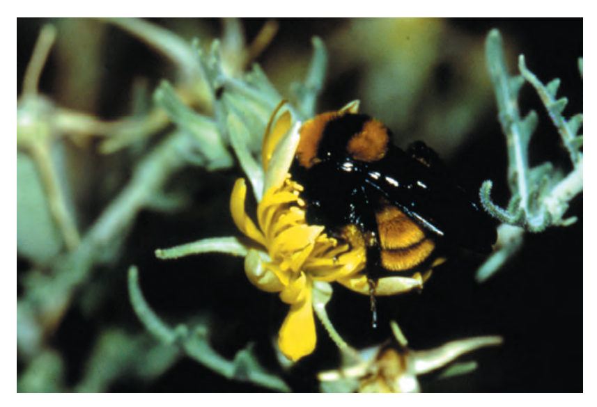
Bumble bees are generalist foragers, visiting a wide range of flowers to feed and gather nectar and pollen. This Sonoran bumble bee ( Bombus sonorus ) is foraging on stick-leaf blazing star ( Mentzelia pumida ).

the whole growing season. Foraging plants can be introduced to a golf course by creating either natural habitat in out-of-play areas or flower borders in more formal parts of the course, such as by the club house or golf shop. Native plants are frequently the best choice for both of these approaches, as they are usually better adapted to grow in the climate and soils of your region. In addition, there are many garden plants that are North American natives, such as black-eyed Susan, Joe-pye weed, and coreopsis, which are wonderful pollinator plants. They may not be native to your region, but mixed with garden plants – particularly older varieties of perennials and herbs that are good sources of nectar or pollen -