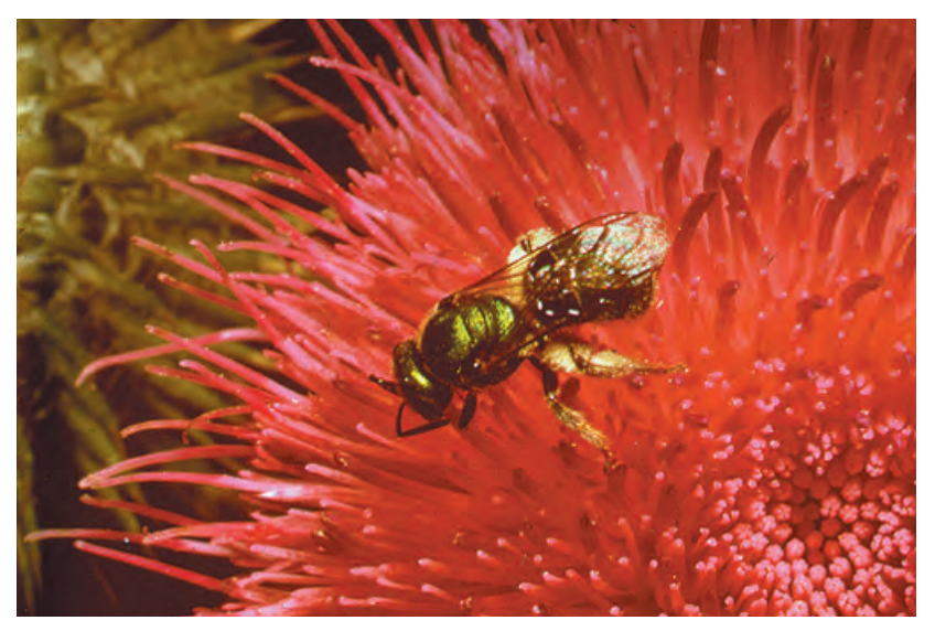
Sweat bees are generalists, able to exploit a wide range of flowers and survive in degraded or weedy plant communities.

term implications for many animal and insect populations. The impact of pollinator declines is already being seen in communities of some rare plants whose reproduction is limited by a lack of pollinators. Often these plants now rely on human intervention for their survival. For example, the fate of the rare Ute lady's tresses orchid