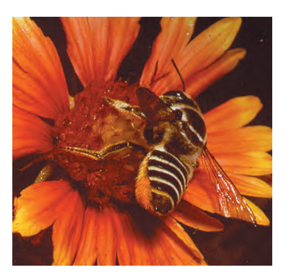
Leaf cutter bee (Megachile sp.) on blanket flower (Gaillardia aristata).

collect nectar and pollen from flowers to carry back to their nests as food for their offspring. In doing so they carry large quantities of pollen from flower to flower. Insects like butterflies, beetles, and flies also feed on nectar and pollen — as do hummingbirds and a few bats — but don't collect it or purposefully transport it. Some pollen gets stuck to these as they feed, and thus moved to the next flower, but this is a