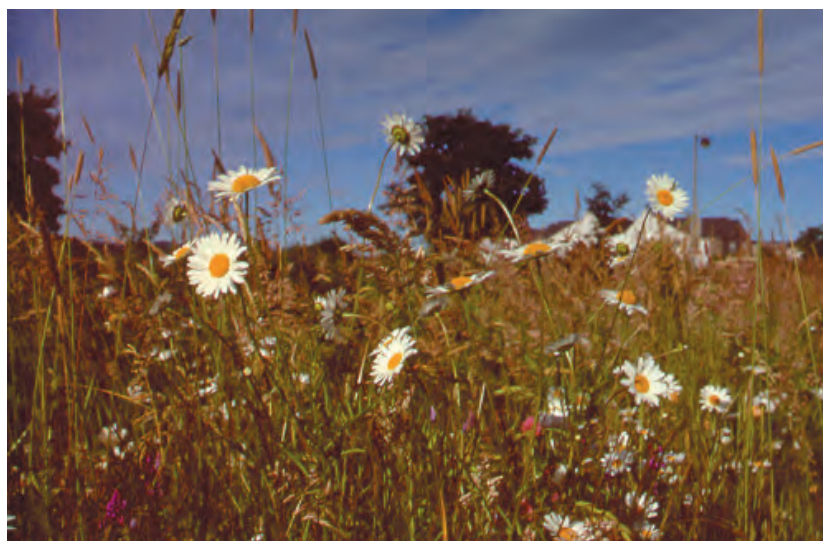
Flower-rich areas will provide nectar and pollen for a wide range of beneficial insects.

In some ways, the ideal approach to creating a natural area is simply to leave it alone and let Nature do her stuff. This tactic can work well in places where there is a neighboring source of appropriate seed, and enough time. In most situations, however, you will need to use plants or seed to create