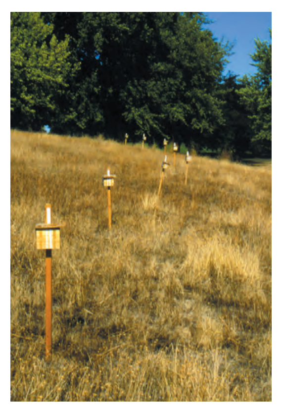
Combining nesting sites with foraging areas will create good native bee habitat.

sunshine, especially in the morning, to provide enough warmth so they can become active.