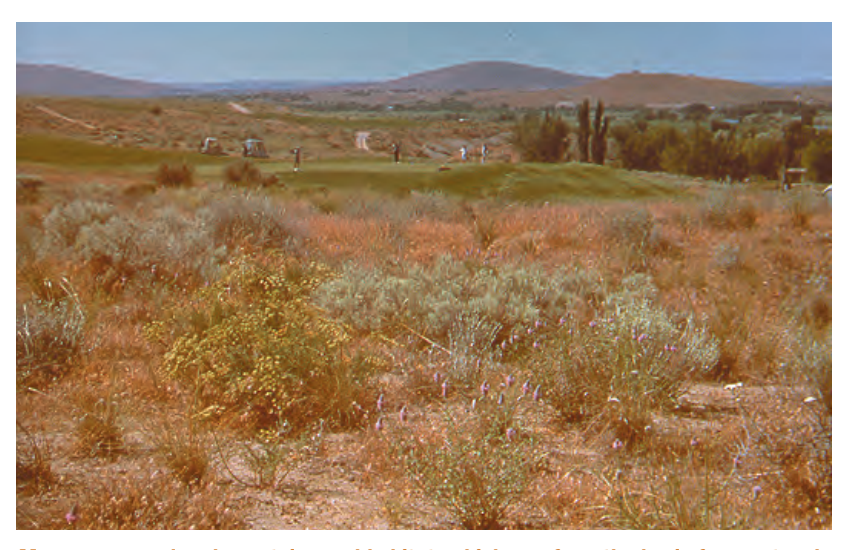
Many courses already contain good habitat, which can form the basis for a network of pollinator areas across the course.

Existing habitat. Look for existing areas of good habitat, as these patches are likely to support pollinators already. The pollinators will benefit directly and swiftly from expanding or enhancing these habitat patches, linking them to other patches, or changing the management regime of adjacent areas.