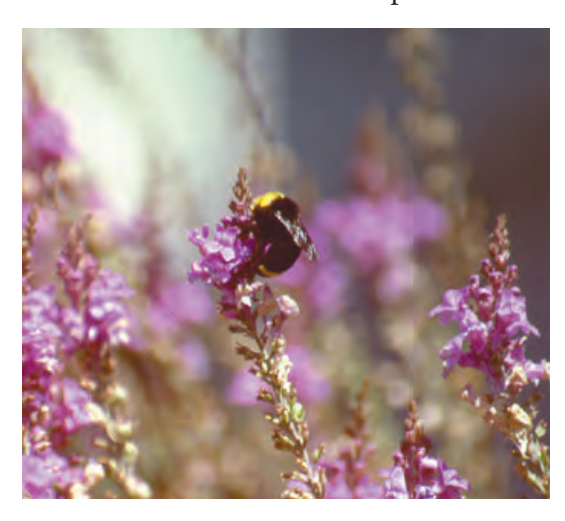
A harbinger of spring in the western United States, yellow-faced bumble bee (Bombus vosnesenskii) queens emerge from hibernation when willows flower.

under a tussock of grass, but mostly they nest underground. An abandoned rodent hole is a favorite, as this space is warm and already lined with fur. The queen creates the first few brood cells from wax, lays eggs, and then provisions them with pollen and nectar as the larvae develop. It will