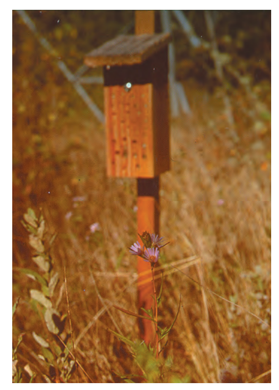
Two things that bees need are flowers for nectar and pollen and nesting sites, like the asters and the wooden block shown here.

Sympathetic management of out-of-play areas can provide excellent habitat that will benefit pollinator insects, as well as many other types of wildlife, and it is these areas