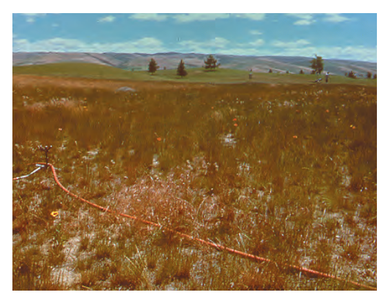
Irrigation and weed control are the two most important maintenance tasks for newly planted areas.

Weed control. Weeds compete for light, nutrients, and water, and will stunt or even kill desirable plants. Lack of weed control is one of the most common factors causing poor establishment of plantings. Mulching the newly planted area will help to suppress the growth of unwanted plants, but is unlikely to provide complete weed control. Herbicides may damage the transplants. The only effective method