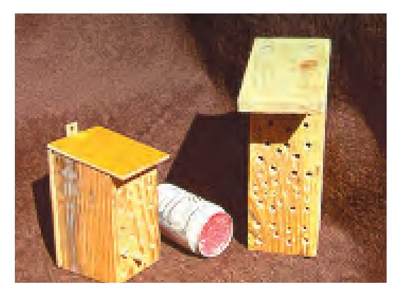
Wooden nesting blocks and other nests for hole-nesting bees can be made in different sizes and styles.

are better as you will be able to drill deeper holes. Avoid treated lumber, as the chemicals may affect the nests, and cedar, which has a natural pesticide (hence it being used for closets and chests to give protection from clothes moths and carpet beetles). In one side of the block, drill holes between 3/32 inch