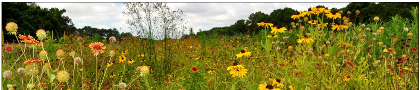
Figure 1 Hedgerow plantings for pollinators can serve other functions, such as habitat for wildlife or beneficial insects. This diverse mix of plants in South Carolina provides a variety of forage and nesting sites for native bees and more.