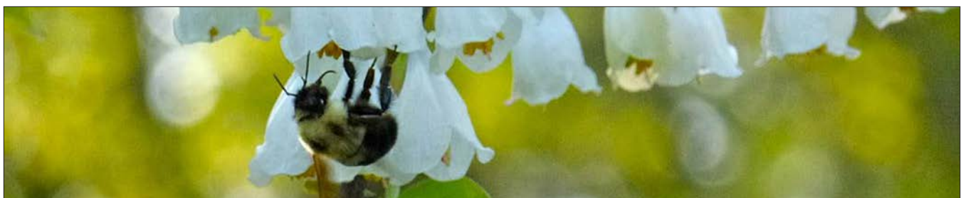
Two-spotted bumble bee ( Bombus bimaculatus) on silverbell ( Halesia diptera).