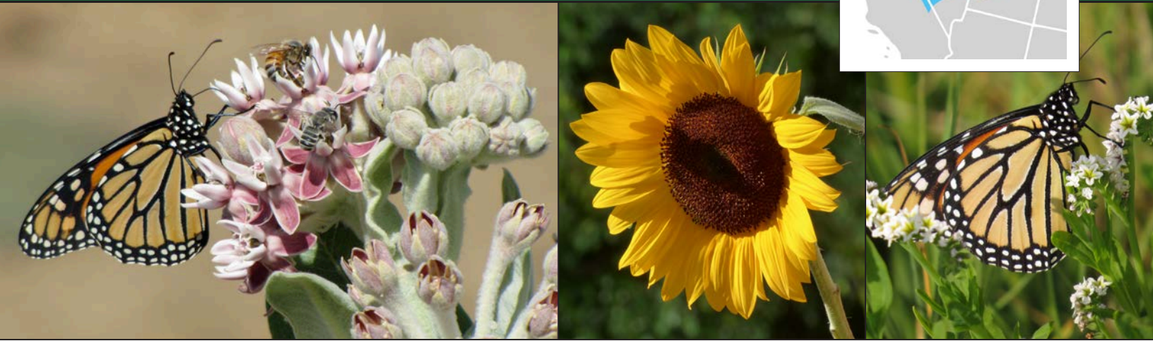
Left to right: Monarch on showy milkweed, common sunflower, and monarch on salt heliotrope.

The Great Basin encompasses the vast majority of Nevada as well as half of Utah and small sections of the surrounding states of Oregon, Idaho, and California. It is a region of extremes, known for its basin and range topography and arid climate. The amazing diversity of habitats, from high alpine mountain ranges to dry desert valleys, supports an impressive array of plant and animal species, including the monarch butterfly, which can be found in protected canyons and riparian areas as well as along irrigation ditches and roadsides throughout the summer.