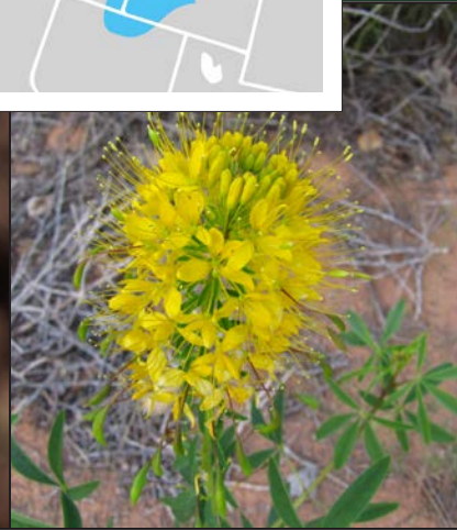
Left to right: Monarch on showy milkweed, cobwebby thistle, and yellow spiderflower.

The Inland Northwest encompasses much of eastern Oregon and Washington stretching from the eastern slopes of the Cascades into parts of western Idaho and northern Nevada. The landscapes in this region are dominated by shrub steppe and open prairie interspersed with juniper woodlands and pine forests. Nectar-rich shrubs and forbs take on special importance in this often arid landscape and are critically important resources for a number of insects and other wildlife, including breeding and migrating monarch butterflies.