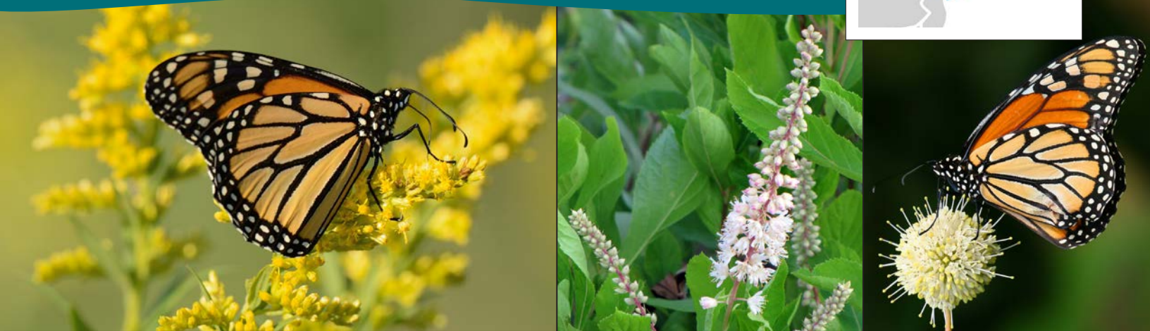
Left to right: Monarch on showy goldenrod, coastal sweet-pepperbush, and monarch on buttonbush.

The Northeast region, composed of the New England states of Maine, New Hampshire, Vermont, Massachusetts, Rhode Island, and Connecticut, as well as eastern New York, is characterized by shifting coastal dunes, deciduous forests, and riparian corridors. Rich floral diversity within these habitats supports thousands of species of bees, butterflies, and other pollinators, including northern populations of summer breeding and fall migrating monarchs. Depending on the year, monarchs can be found throughout the region, often favoring open fields and meadows, river valleys, and coastlines.